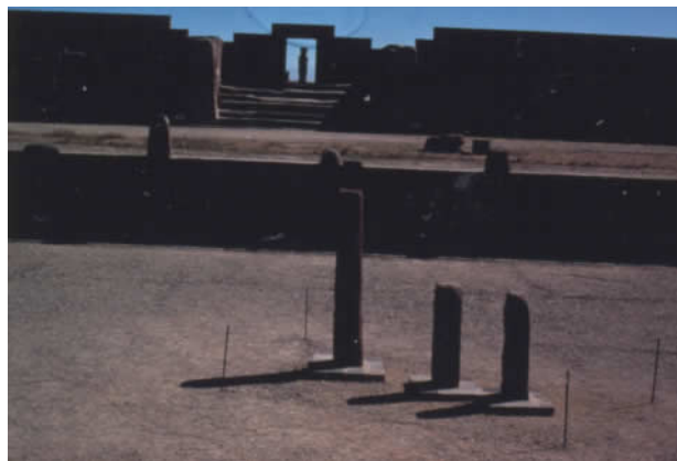
Photograph 1. Kalasasaya temple complex at Tiwanaku.

Tiwanaku, besides being an large city, contained several large temples which were surrounded by a moat, creating a miniature lake with the temple complex as an island. The central temple, called the Akapana, was constructed in a series of seven tiers, to resemble the nearby peaks. Tiwanaku engineers plumbed the Akapana with drains so that when the annual rains arrived, water would thunder through it. "It was a way of renewing the earth and maintaining the circulatory system of the universe," says Alan Kolata, a University of Chicago archaeologist, who thinks the Tiwanaka probably celebrated fertility ceremonies and other rites while water roared through their mountain-temple (see Photograph 1).