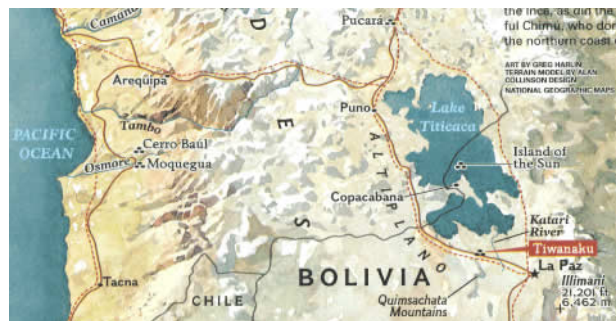
Map 1. General Map of the Lake Titicaca region.

The Empire rose about 400 AD, fed by local abundance - fish from the lake Titicaca (the world's highest navigable lake), meat from llamas and alpacas pastured on high plateaus, and potatoes and other crops grown in raised-bed fields fed by irrigation channels and drained by massive ditches. Like other empires, Tiwanaku's expansion depended on abundant food production, and for over seven centuries, it regularly produced food surpluses. These surpluses were a product of ingenious irrigation systems.