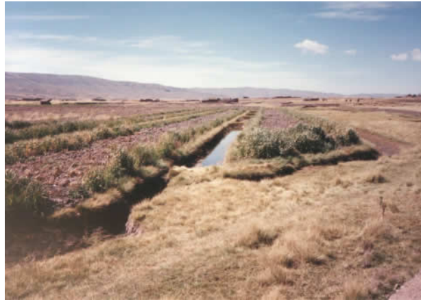
Photograph 2. Modern-day raised-bed irrigation systems at Tiwanaku.

A 32-year drought from 563-594 AD caused widespread devastation across empire. There is evidence, however, that a lesson was learned. The rulers took the catastrophe as a warning. They revolutionized their agriculture, instituting a totally new system which, some believe, allowed the empire to prosper for an additional 400 years. In any event, Tiwanaku agricultural surpluses after the drought can be attributed to raised-bed irrigation. Water surrounded raised agricultural mounds (see Photograph 2).